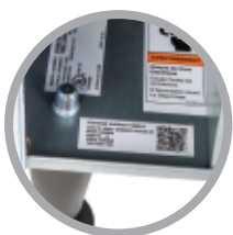
Unit specific QR code for quick access to service manuals, cleaning guides and warranty history