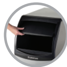
Ergonomic slide back door allows easy access to ice in the bin